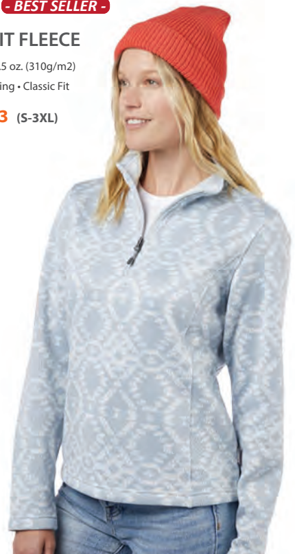
new Morning Sky