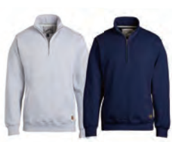
Heather Athletic Grey Navy