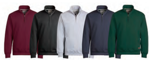
Maroon Black Heather Athletic Grey Navy Forest Green

Fabric: 80% Cotton 20% Polyester 9 oz. (300g/m2) • High quality YKK® zipper • Rib knit cuffs and waistband • Side hand warming pockets • Vintage-inspired trims