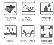
Heather Deep Blue

(*Talls, XS and 5XL available in Black, Carbon)