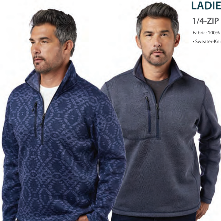
new Night Sky