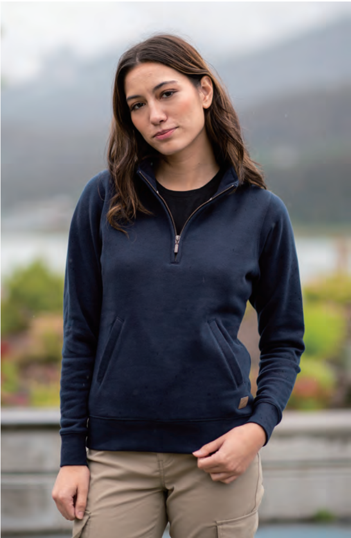
CF-03 Rockridge 1/4-zip Fleece Pullover (XS-4XL)